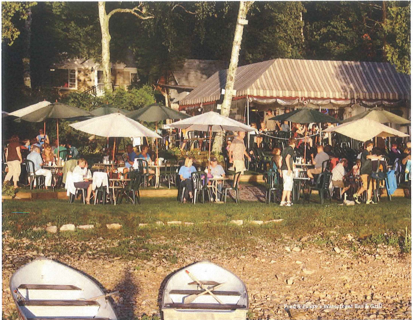
Fred & Fuzzy's Waterfront Bar & Grill