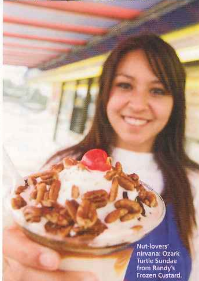
Nut-lovers' nirvana: Ozark Turtle Sundae from Randy's Frozen Custard.

Strawberry-rhubarb with almond (937/361-7785; dessertsbyannk.com).